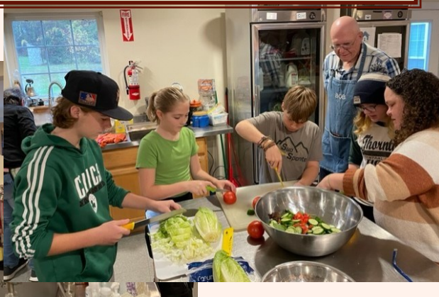
Youth groups cooking dinner at Bridge House.