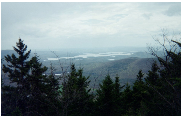
View from last month's hike

Second Sunday Hike - June 12 - Paradise Point Nature Center and Wildlife Sanctuary on the north shore of Newfound Lake in Hebron. This is the perfect hike for “turtles” of all ages! There are three hiking trails (1 mile, 1/3 mile, and 3/4 mile) on the forty-three acres which includes 3,500 feet of rocky, unspoiled lakeshore. We will depart from SKUUF lower lot at noon. Please register with Deedie for any necessary weather updates.